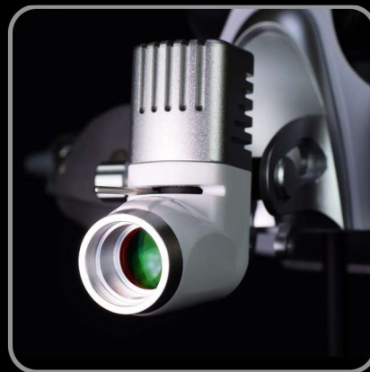
High Power LED