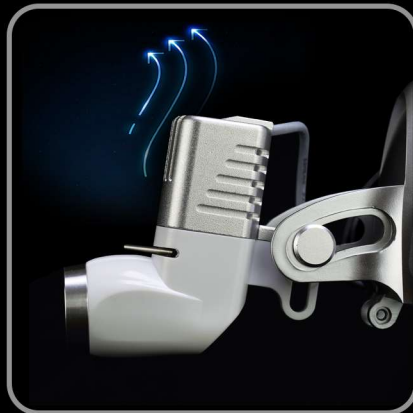
Efficient heat management