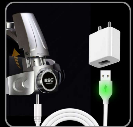
Detachable Battery with USB Charger